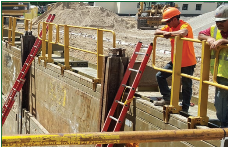
Guard Rail on Slide Rail Panel