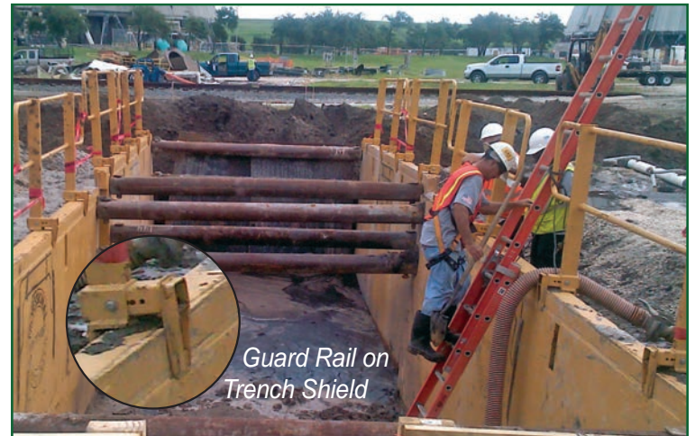
Guard Rail on Trench Shield