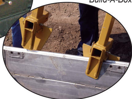
Barrier Post on Build-A-Box