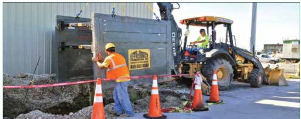
XLAP-SF 3 in. Aluminum steel frame double Sidewall Trench Shield